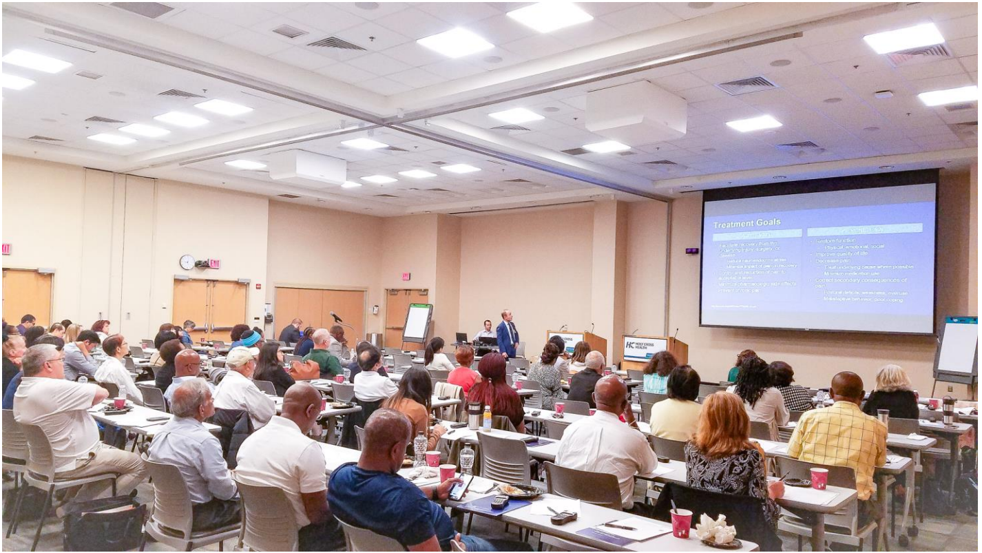
WMSHP Saturday September 14th 2019 all day CE seminar participants at Holy Cross Hospital, Silver Spring, MD..