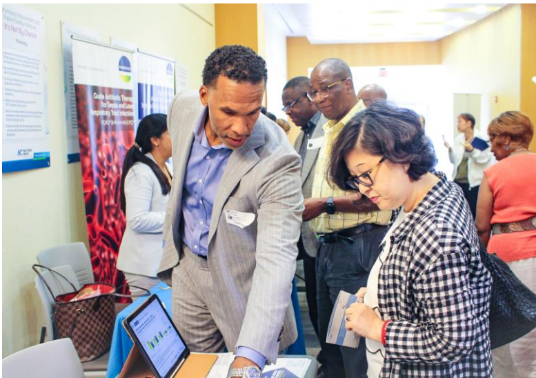
Members enjoy meeting pharmacy representatives at Sept 14 th WMSHP conference